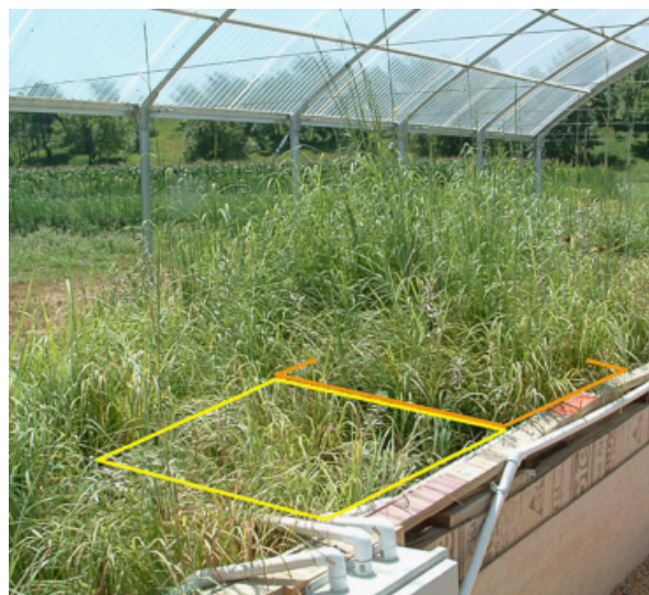
Fig. 1 The Rainfall Mesocosm facility at the Konza Prairie Biological Station in NE Kansas, USA, showing a 400 mm yr -1 mesocosm (left) and an adjacent 1000 mm yr -1 mesocosm (right).

We conducted an experiment to examine the possible impacts of extreme rainfall events on key aspects of carbon cycling in experimental grasslands composed of C_4 grasses and C_3 forbs and legumes in a novel rainfall manipulation facility in NE Kansas, USA (Fig. 1). The experiment focused on three primary questions. (1) How does the effect of variation in I differ with Q ? This question addresses the hierarchical relationship between intra- and interannual rainfall variability. (2) Do ecosystem processes respond similarly to variation in I , Q , and S_E ? This question addresses the effects of rainfall variability on the balance among pools and fluxes of carbon. (3) How do ecosystem processes respond to the same S_E produced by different I/Q combinations? This question addresses how ecosystem function may be primed, or inhibited, by the overall pattern of variability. To answer these questions, we measured the responses in soil water content (SWC) and three key processes involved in ecosystem function and C cycling: